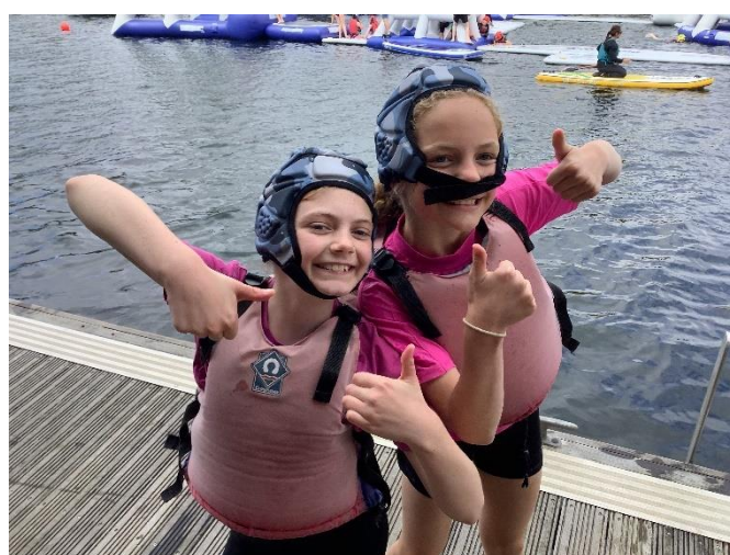
Girls in pink...

Y5 had a wonderful time visiting Liverpool Watersports Centre for their most recent trip.