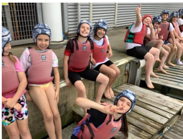
With our friends...