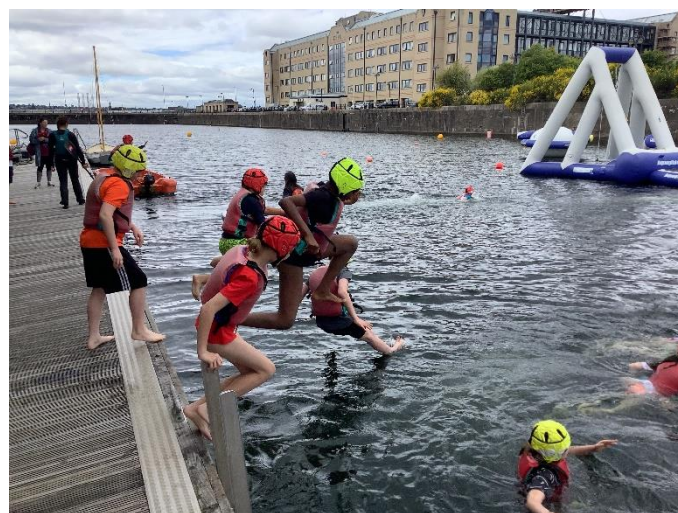
Making a splash!